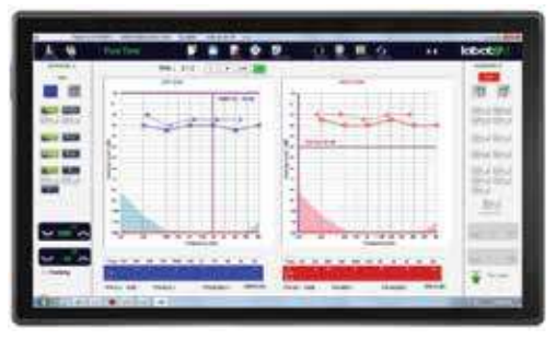
PTA - Pure Tone Audiometry