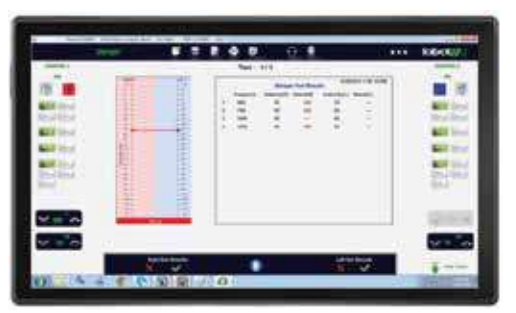
Stenger - For patients who are suspected to malingering a hearing loss