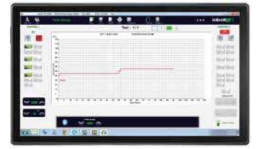
Tone Decay - To detect and measure auditory fatigue