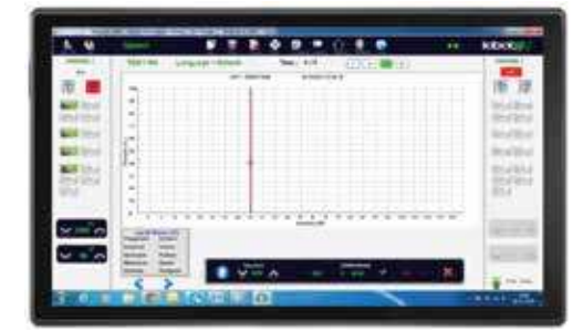
Speech Test - Option of live voice / recorded speech and the programming of local speech material