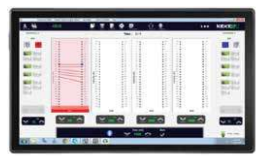
ABLB - To detect perceived loudness difference between the ears for people with unilateral hearing loss