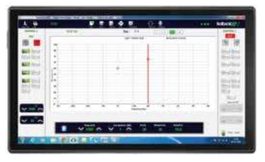
SISI - To differentiate between cochlear and retro cochlear disorder