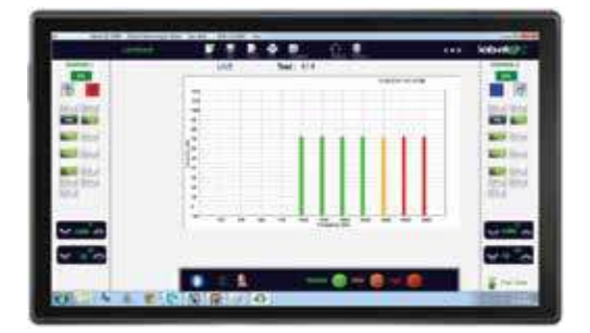
Lombard - The observation of fluctuations in the intensity of a patient's voice